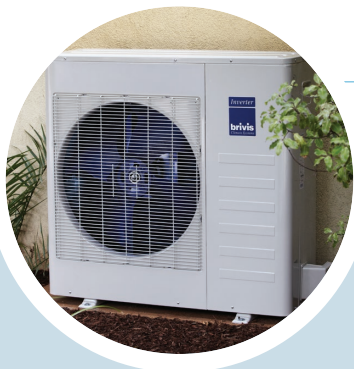
Outdoor Condensing Unit

A typical installation includes a system of insulated duct work distributing conditioned air throughout the entire home.