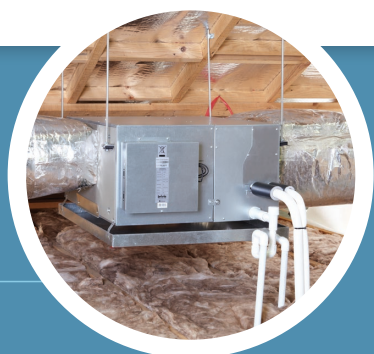
Indoor Fan Coil Unit installed within a roof space